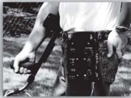
Hip and chest-mountable!