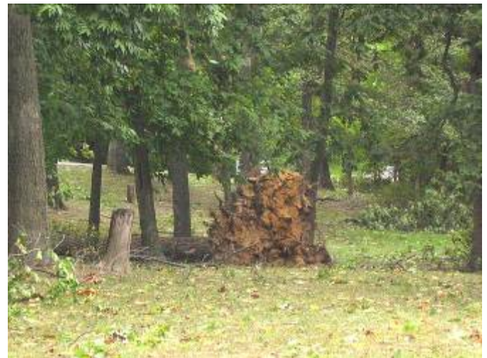
ONE OF SEVERAL DOWNED TREES

Barb Connelly came back from the camping area and I asked her if my camper was still up there in one piece. We were next to each other. She said all was OK but there were trees down all over and power lines and oh yes she did chase all my left over hunt field flags I had left in a bucket under the camper. (Thanks again Barb)