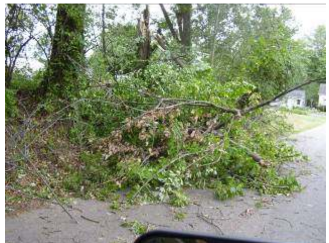
THIS GUY WAS HOGGING THE ROAD