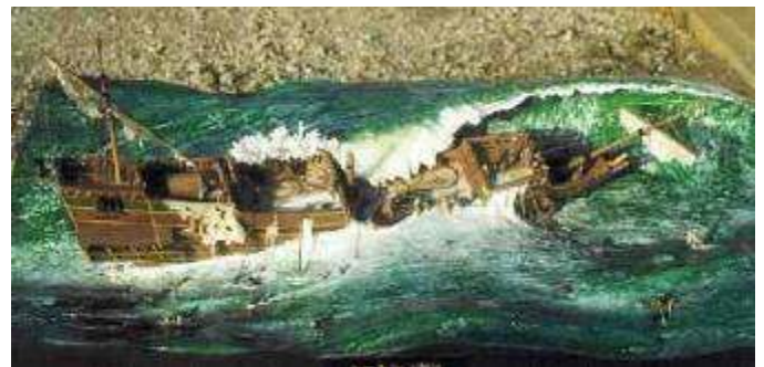
ARTISTS RENDERING OF THE SINKING OF THE ATOCHA

For those of you not familiar with Mel's story, he spent 16 years of search and research looking for this fabulous treasure ship – without success – before finally on July 20, 1985, locating the heart of the $450,000,000 treasure. Even after 23 years the hunt for remaining items of Atocha's treasure goes on today.